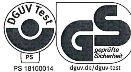
Approved design for a height of 20 mm or less