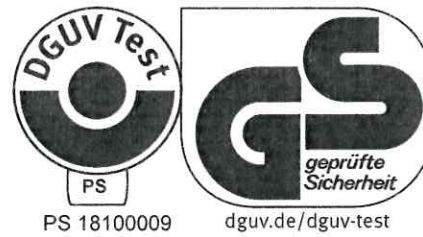
Approved design for a height of 20 mm or less