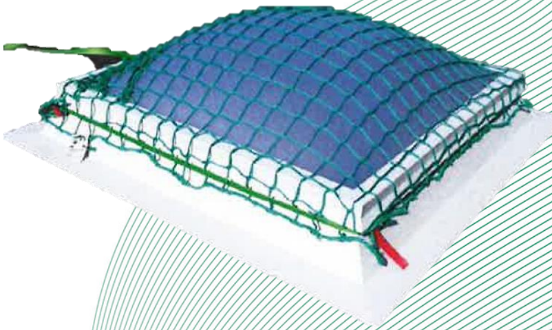
Fig. 1: Anchor device, type: Dome light net

The system is mounted on the crown of a sufficiently strong skylight dome by means of a strapping belt with a tensioning element. The webbing is looped through the net meshes and is attached to the net by additional loops. On the webbing the user can secure himself with the connector of his personal fall protection equipment.